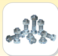
High tensile fasteners