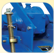
strong gear box