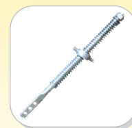
Flexible Damper Spring Assbly.