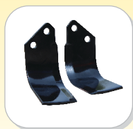
International quality blades